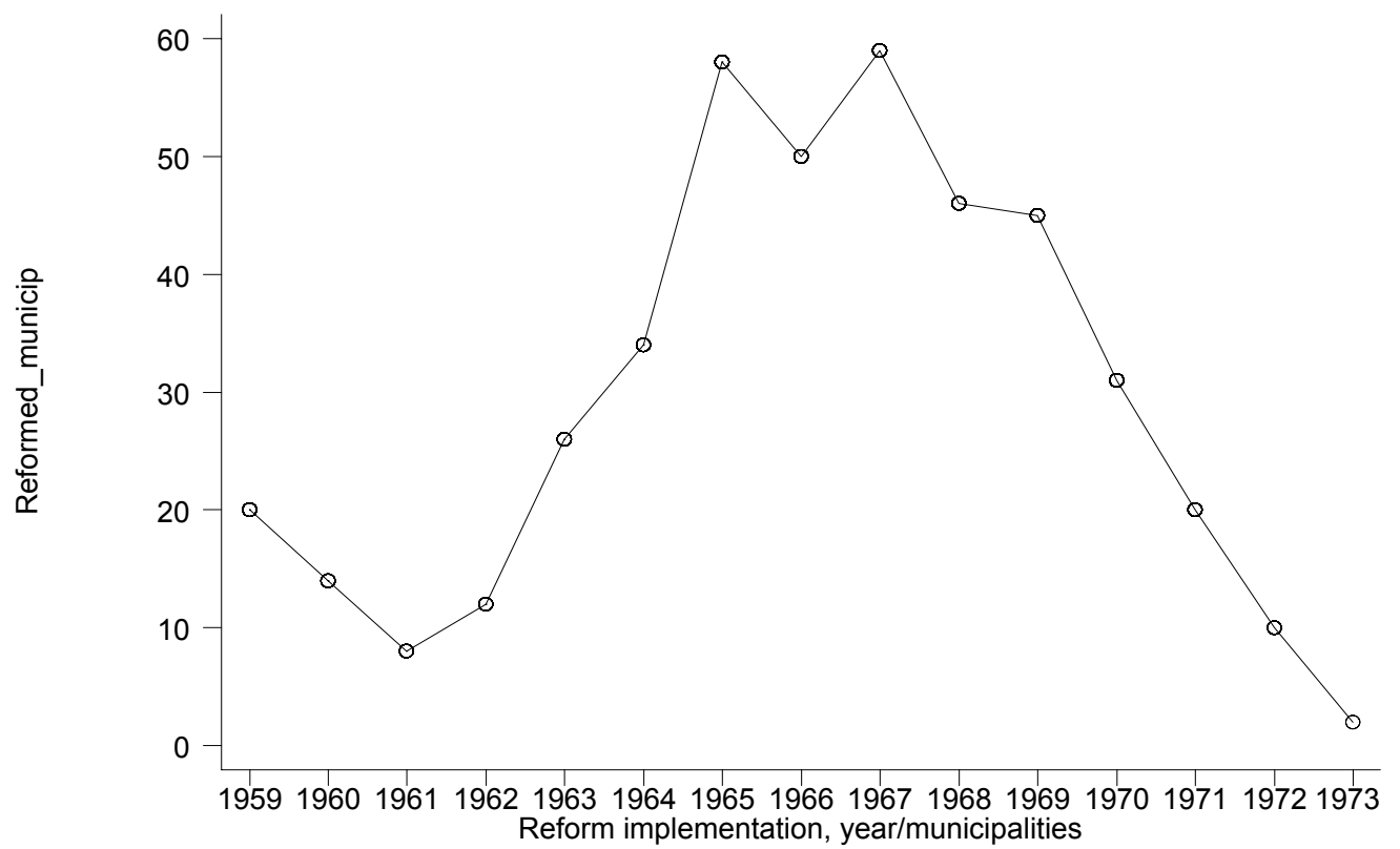
Figure 1 The Number of Municipalities Implementing the Education Reform, by Year