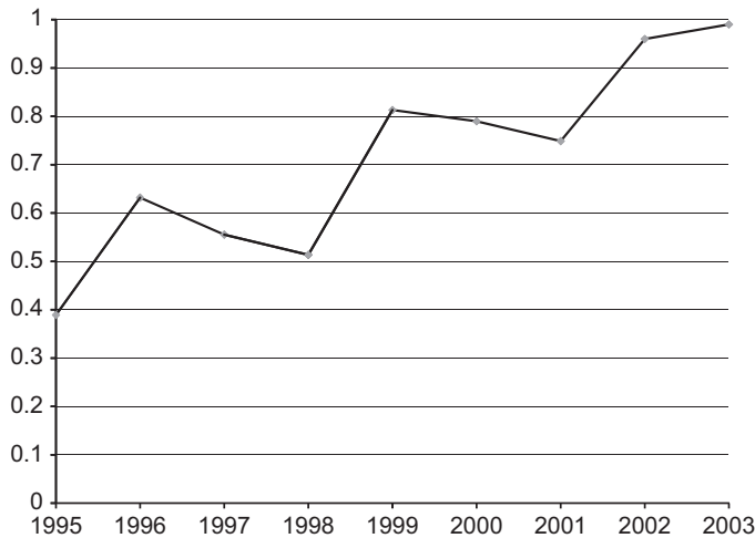
Fig. 1. Ratio of net inflows to passive funds. The figure graphs the proportion of net fund inflows going into passive versus active funds. It tracks the growing appeal of passive assets during our sample period from 1995 to 2003.

The index funds display a surprising degree of heterogeneity, 5 with mean 10-year returns ranging from 11.13% for the Vanguard Institutional Index (VINIX) to MainStay Equity Index A (MSCEX) at 10.12%. The Vanguard S&P 500 Index has a mean 10-year return of 10.99%.