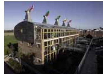
The Challenge: Growing the 'Social Economy'

Which global problems can and should be addressed most effectively by social entrepreneurship and social investment? In which asset classes will it prove particularly effective in the future, and how can we increase their importance in these classes? How can governments provide an institutional and legal setting to enhance the power of social entrepreneurship to address problems such as poverty, inadequate infrastructure, health problems, education and training, welfare provision? How can social entrepreneurs interact with international organizations and NGOs to promote the global public interest? To what extent will government intervention or interaction with NGOs undermine the credibility and long term effectiveness of social entrepreneurship?