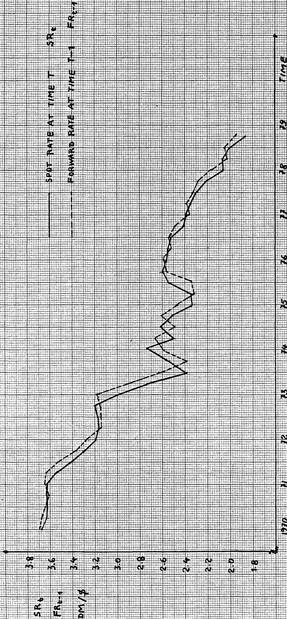
FIG. 1 SPOT EXCHANGE RATE AT TIME T DM/$ FORWARD EXCHANGE RATE AT TIME T-1 DM/$ 'BACKWARDATION'