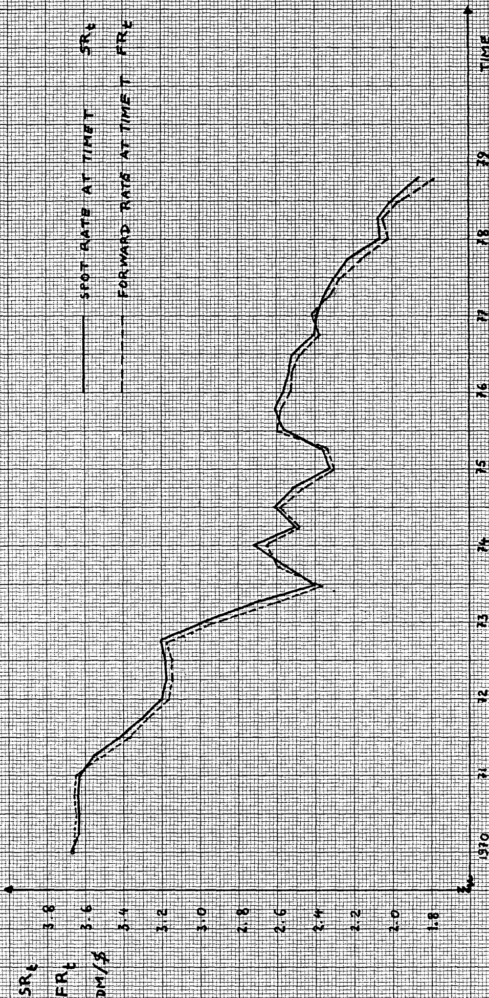
FIG. 3 SPOT AND FORWARD EXCHANGE RATE DM/$ AT TIME T 'CONTANGO'