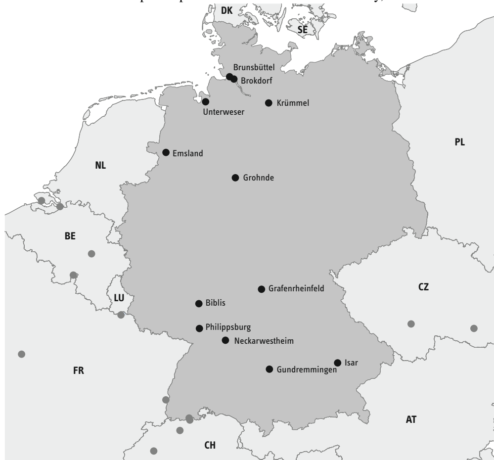
FIG. 1: Nuclear power plant sites in and close to Germany, March 2011

Note: German nuclear power plant (NPP) sites are marked by black dots and with name. Foreign NPPs are marked by grey dots and without name.