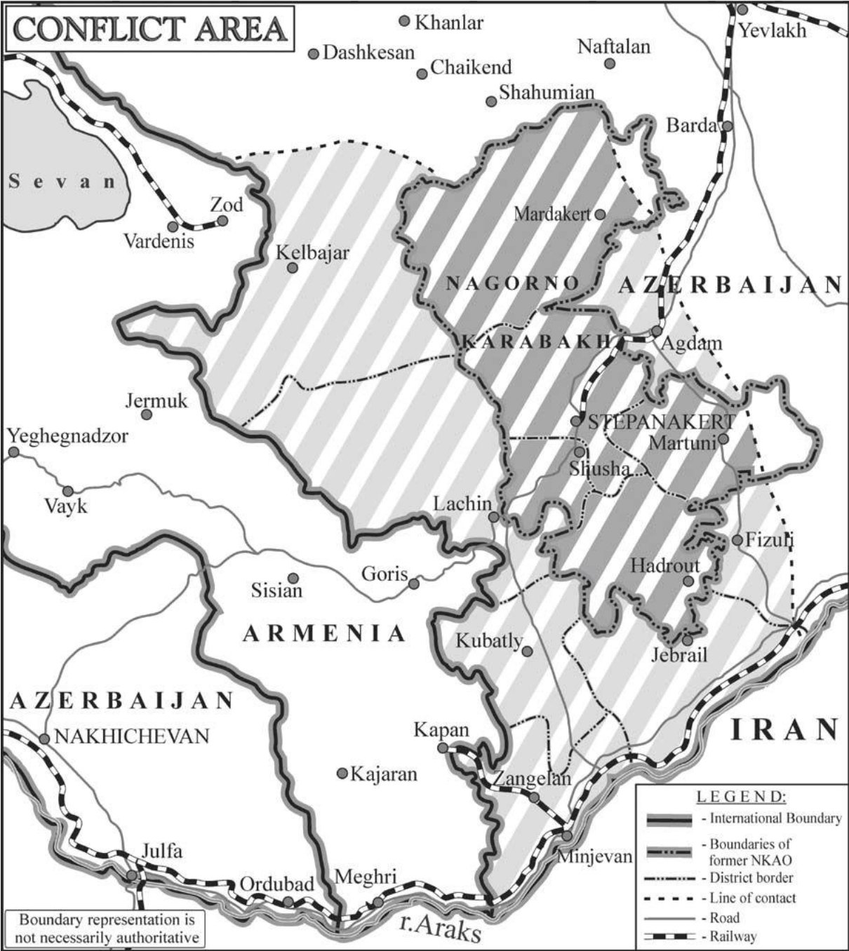
Figure 2: Map of Nagorno-Karabakh