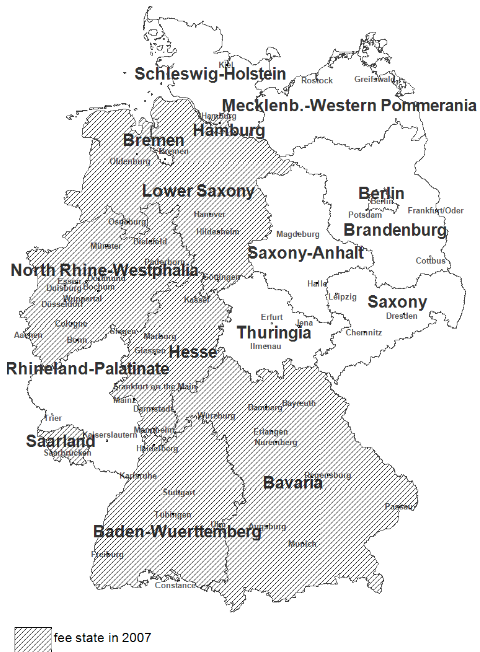
Figure 1: University cities in Germany