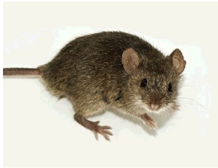
Figure 1: Picture of a mouse as presented in the instructions of the experiment.

unsuited for study. They were perfectly healthy, but keeping them alive would have been costly. It is standard to gas such mice. This is common practice in laboratories conducting animal experiments. Thus, as a consequence of our experiment, many mice that would otherwise all have died were saved. Subjects were informed about this default in a post-experimental debriefing. 5