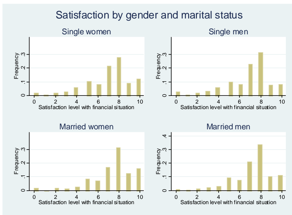
Figure 1: Frequencies of reported levels of satisfaction with financial situation