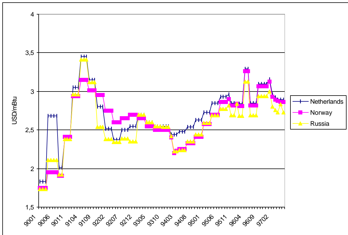
Figure 2. Import prices for natural gas from the Netherlands, Norway and Russia to Germany.