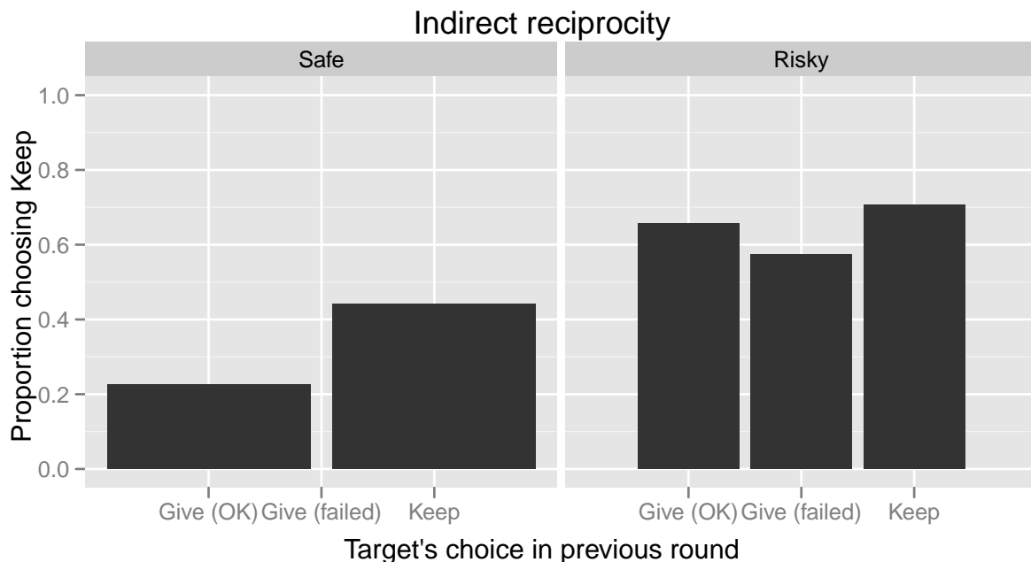
Figure 3: Average helping in treatments with image scores separately for all possible recipient's last round choices

SureInfo(C) , a donor who gave is 26.1 percentage points more likely to expect a return than a donor who did not give; in RiskyInfo(C) , the difference is only 12 percentage points. This, apart from risk aversion, may cut down on the effects of indirect reciprocity as result 2 points out.