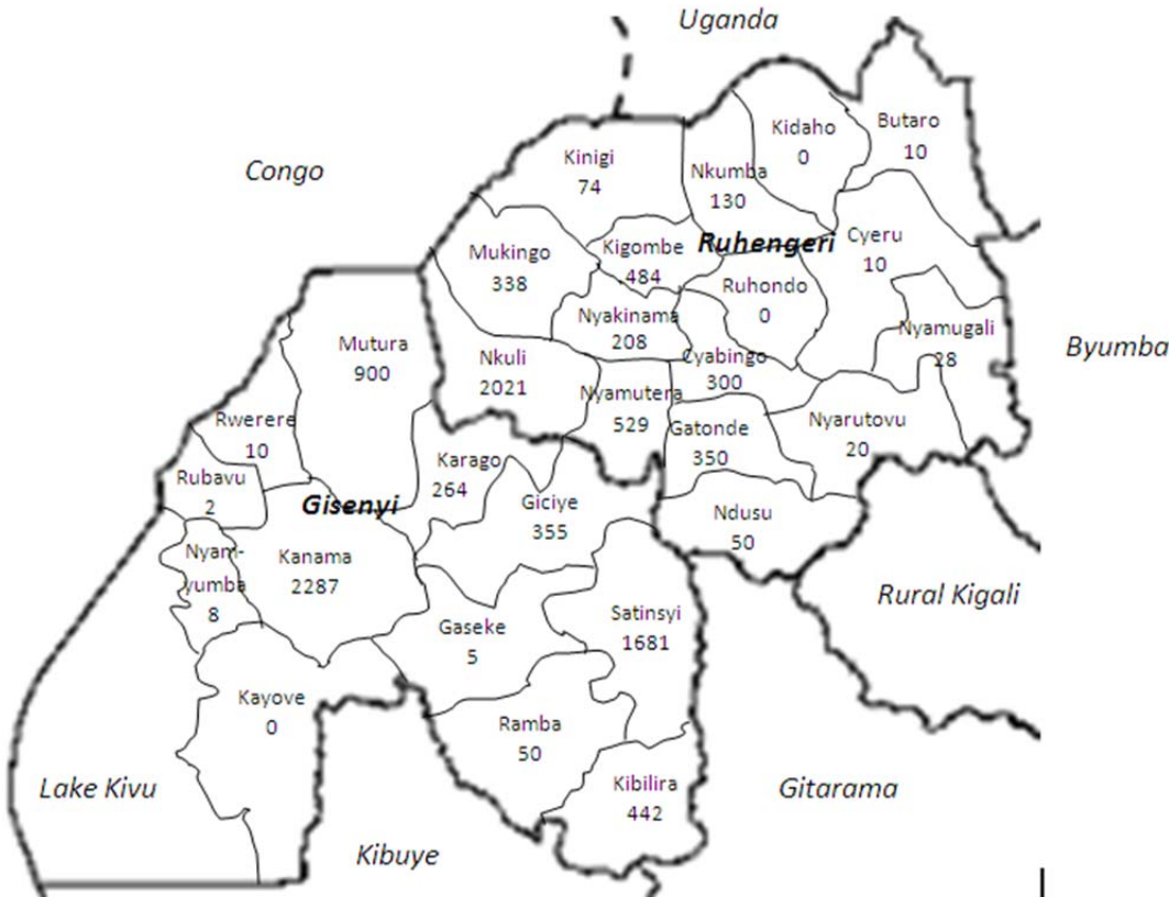
Figure 4: number of alleged 1995-1998 extrajudicial killings of civilians for administrative communes located in Ruhengeri and Gisenyi

Note: own compilation by plotting information on alleged extrajudicial killings from four Amnesty International reports (Amnesty International 1996, 1997a, 1997b, 1998) on an administrative map of Rwanda.