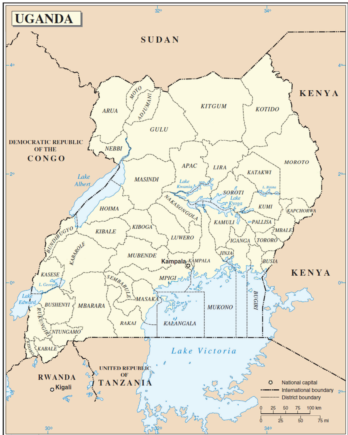
Figure 1: Administrative map of Uganda