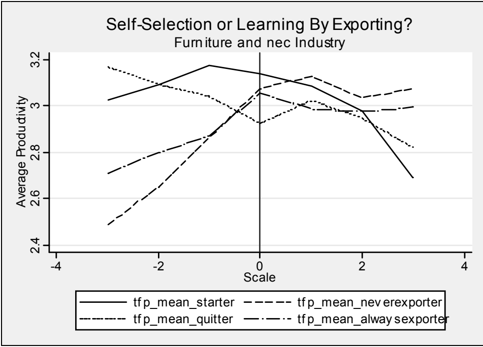
Figure 3: TFP Trajectories for Different Groups (Furniture and NEC)