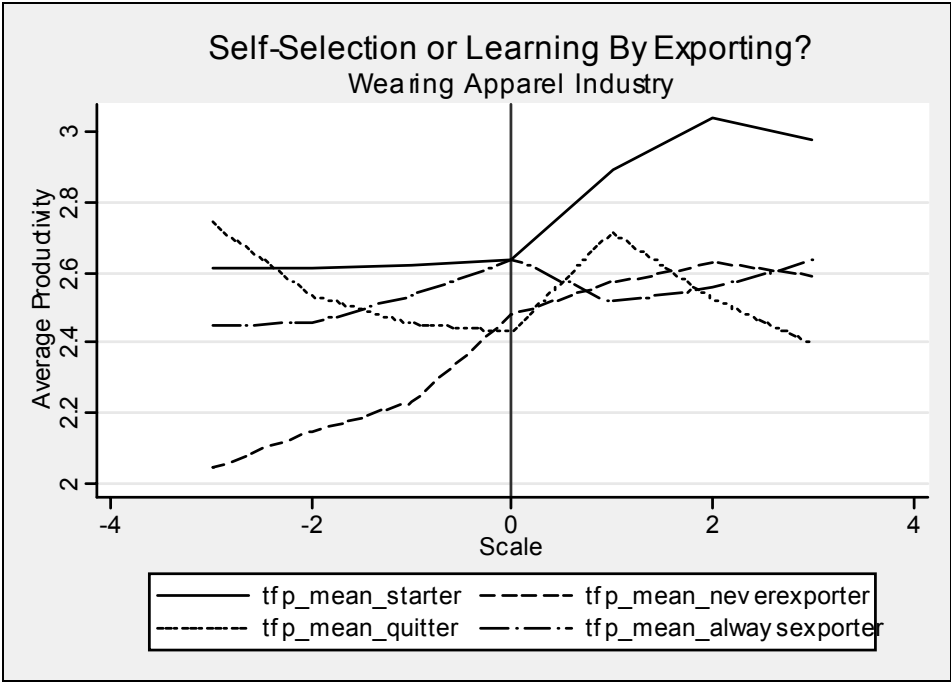
Figure 2: TFP Trajectories for Different Groups (Wearing Apparel)