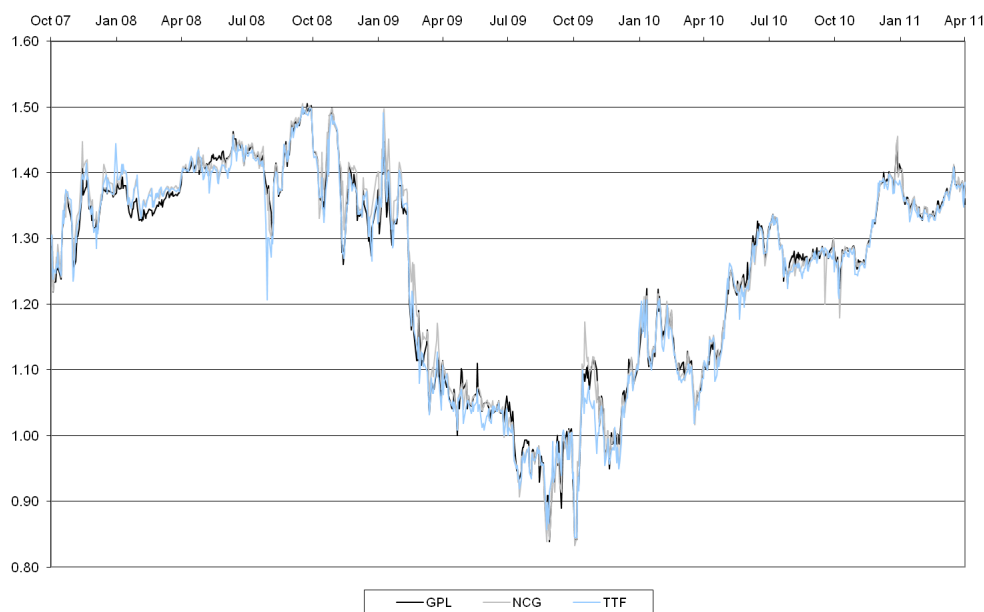
Figure 1: Logarithmic day-ahead spot prices (€/MWh)

It can be seen from Figure 1 that the day-ahead prices for natural gas were volatile throughout the time period considered for all market areas. The prices became more volatile during the last quarter of 2007, while the volatility declined from the first quarter of 2008 to the third quarter of 2008. From the first quarter of 2009, prices witnessed a steep decline. The development is likely - at least to some extent - to be explained by the falling prices for crude oil. 11 Since the third quarter of 2009, gas prices have started to rise again due to the on-going recovery of the economy after the crisis 2008/9. All in all, the price series show a rather similar development pattern over time 12 leading to the expectation of highly integrated markets, and thus values close to one for the coefficient in equations (2) and (3).