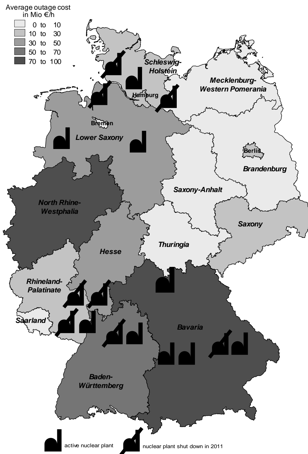
Figure 3: Average total outage cost on the federal state level in Mio€ per hour