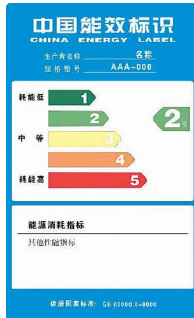
Figure 2 China Energy Label