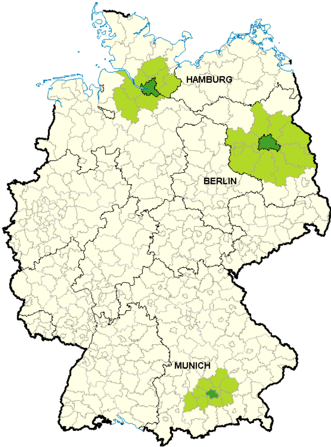
Figure 2: Labor Market Regions of Berlin, Hamburg, Munich