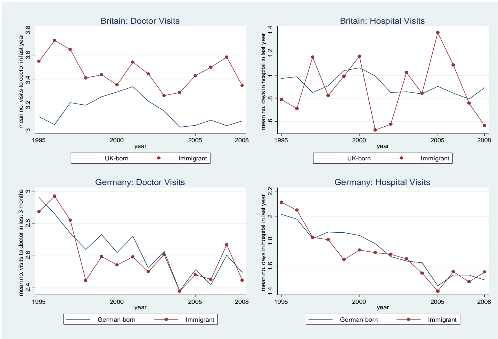
Figure 1. Number of Visits to Doctors and Hospital by Time