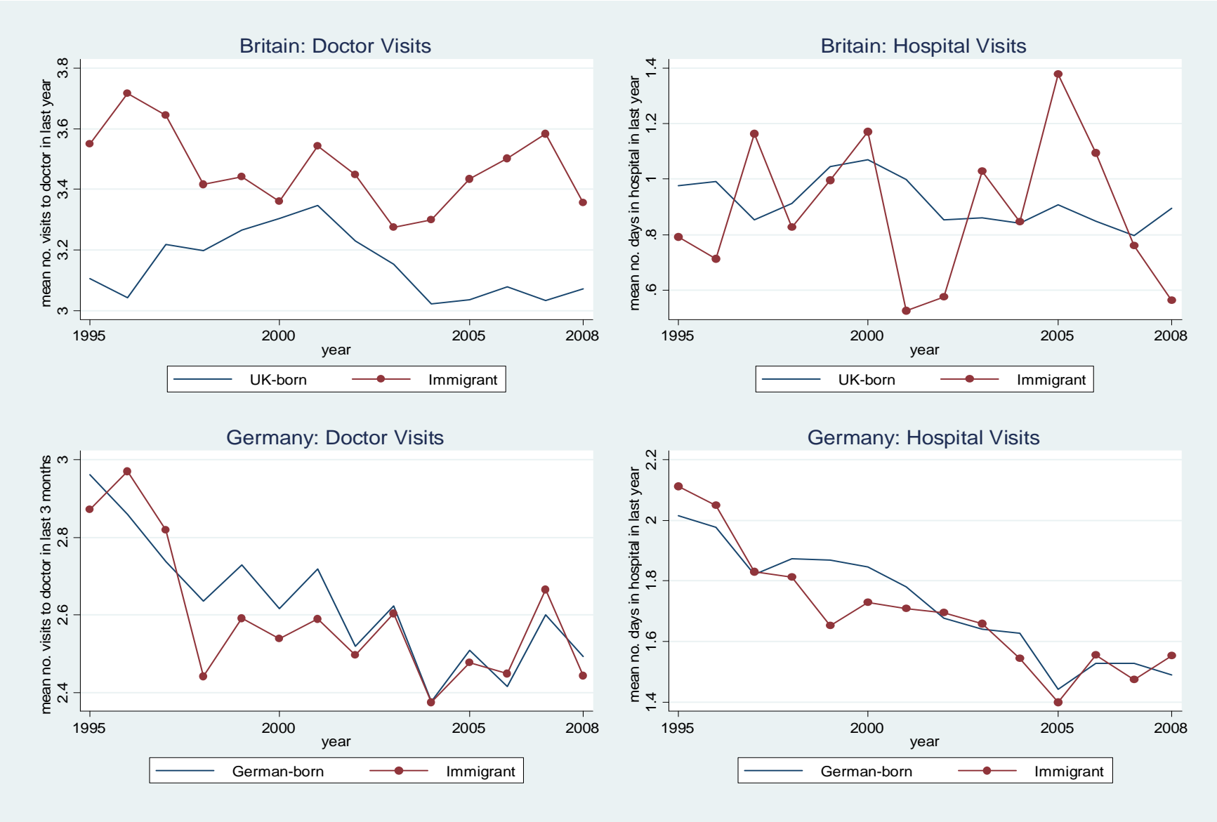
Figure 1. Number of Visits to Doctors and Hospital by Time