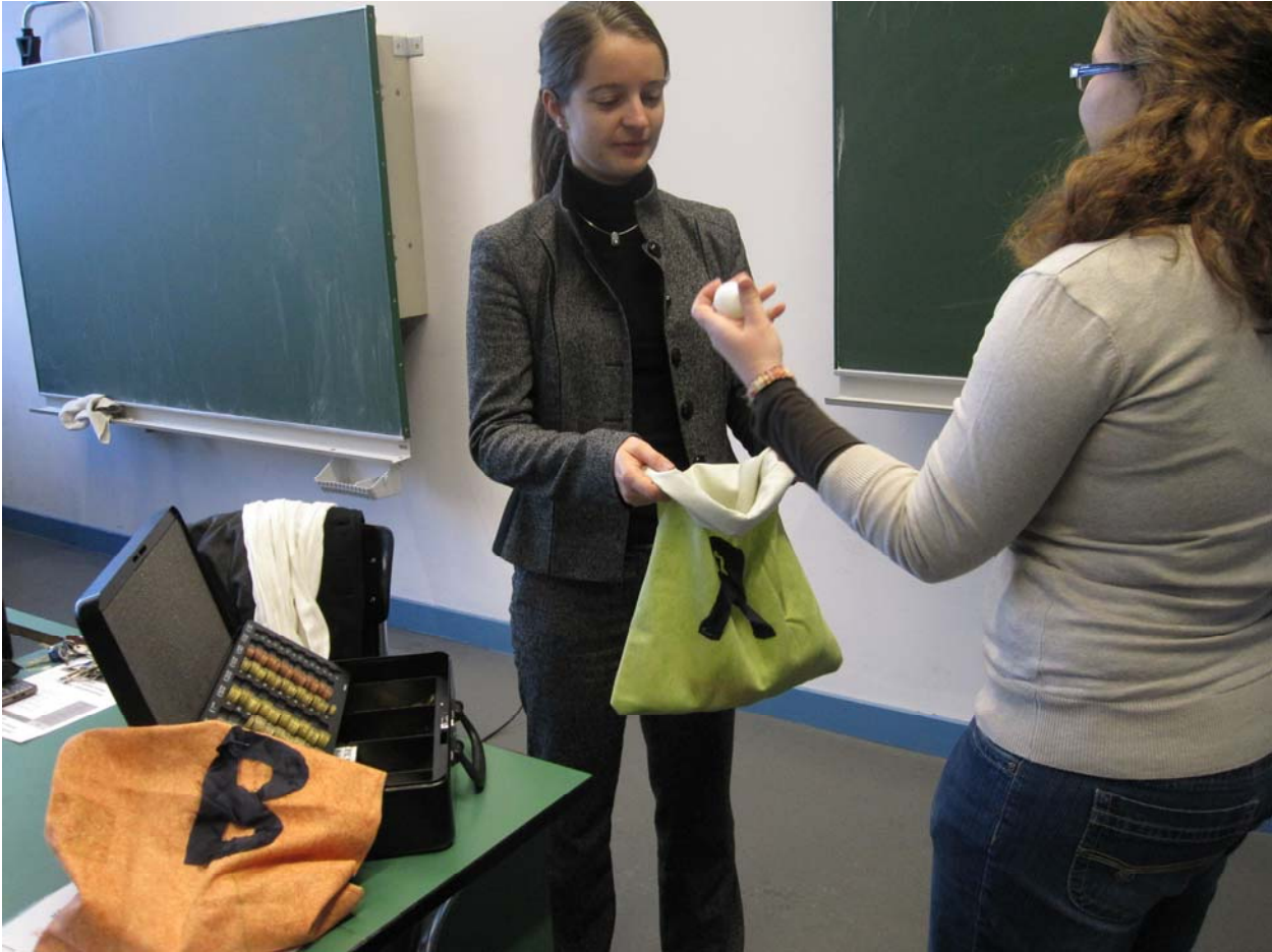
A photograph illustrating how participants drew from one of the bags (A or B)