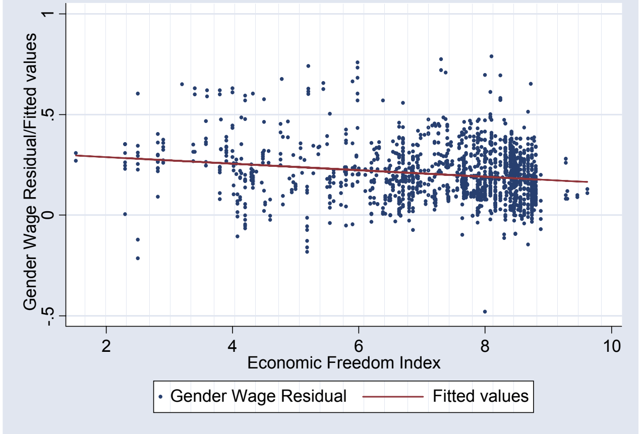
Figure1: Economic Freedom and the Gender Wage Residual