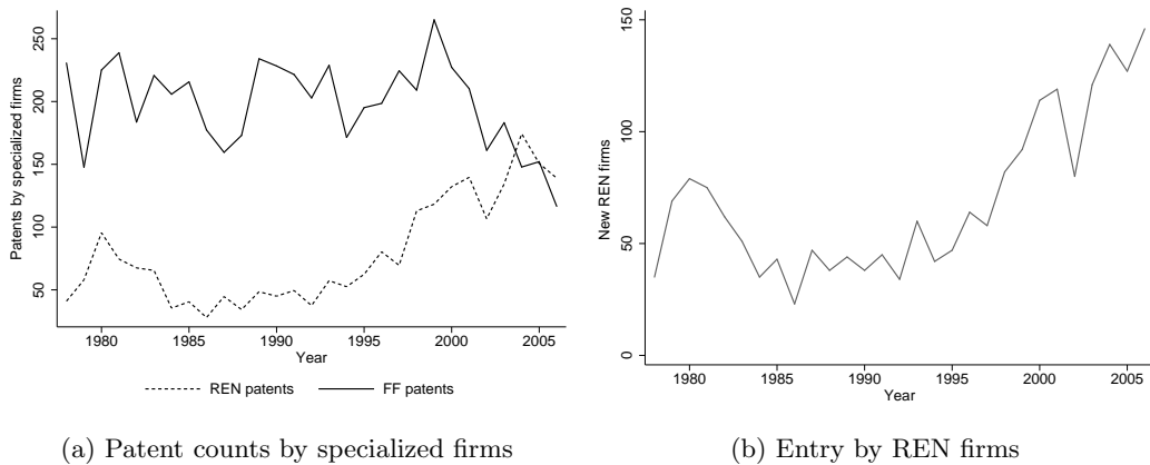
Figure 4: Patents and entry by specialized firms

in REN innovation, i.e. the replacement of FF by REN patents, can only occur via the entry of new firms. Figure 4b plots the number of new REN entrants over time. The trend closely follows the number of REN patents, suggesting that REN firms file relatively few patents per firm.