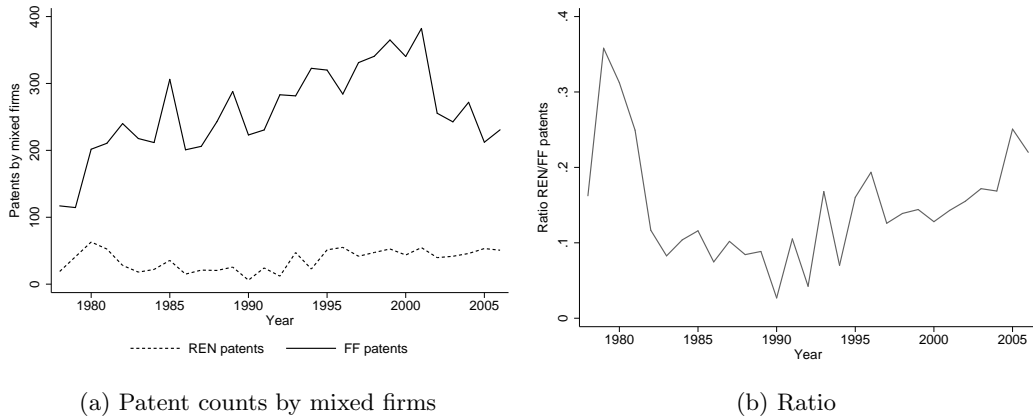
Figure 3: Patents by mixed firms