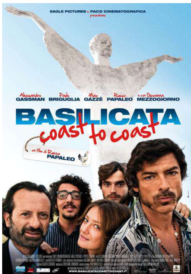
Fig. 1: The movie poster of Basilicata coast to coast