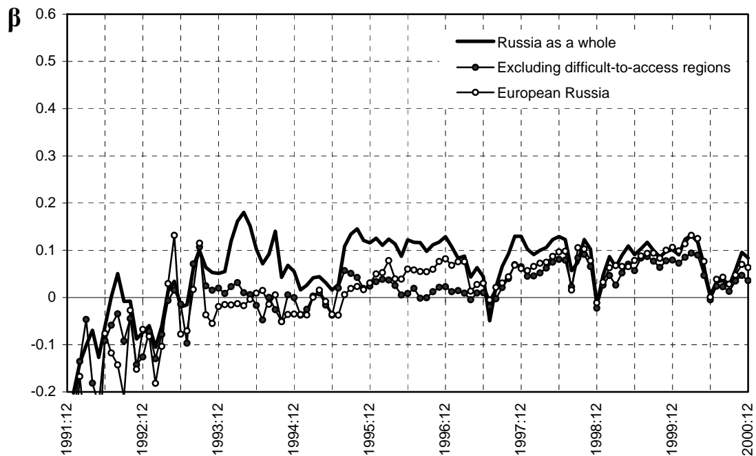
Figure 3. Evolving integration of market for sugar

Features of integration in the sugar market owe to its specificity. This market is a complex structure in which suppliers of raw stuff, producers and suppliers of final product are interlaced with one another, in particular, by contracts regarding goods made on commission, vertical integration, etc. Such a structure is very far from the competitive market; a considerable share of the market is controlled by regional and inter-regional oligopolies (Avdasheva and Rozanova, 1999). Besides that, domestic market agents permanently struggle with foreign suppliers in this market, which results, from time to time, in taking protectionist measures. For example, a 25-percent custom duty for deliveries of sugar from Ukraine was introduced in the middle of 1997. Probably, it was this duty that caused increase in market segmentation in the second half of that year.