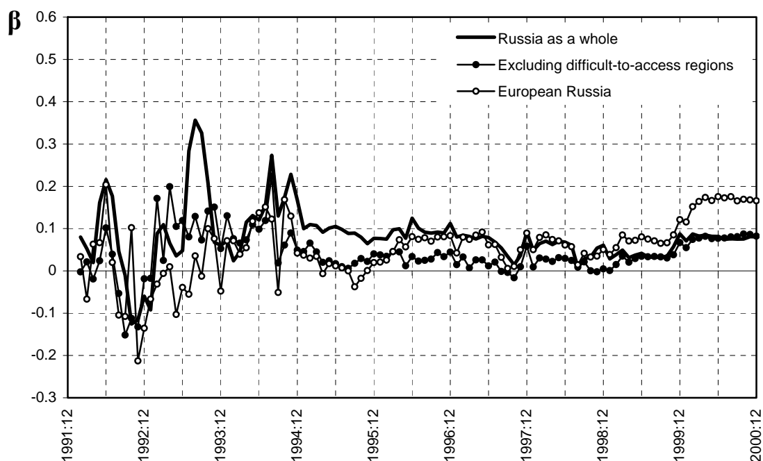
Figure 4. Evolving integration of market for sunflower oil

As early as since the beginning of 1995, the degree of integration of the sunflower oil market became fairly high. In Russia as a whole, \beta is for the most part equal to about 0.1. The degree of segmentation in the aggregated market of 25 staples decreased to such a value only after the August 1998 crisis. If one considers Russia excluding difficult-to-access regions, the value of \beta oscillated around the level of 0.025 during 1995–1999 – less than half as much as \beta in the market of 25 staples in 1999–2000. However, the degree of segmentation of the sunflower oil market increased to about 0.08 in this part of the country in 2000, so exceeding the value for the aggregated market. We failed in finding reasons for this anomaly.