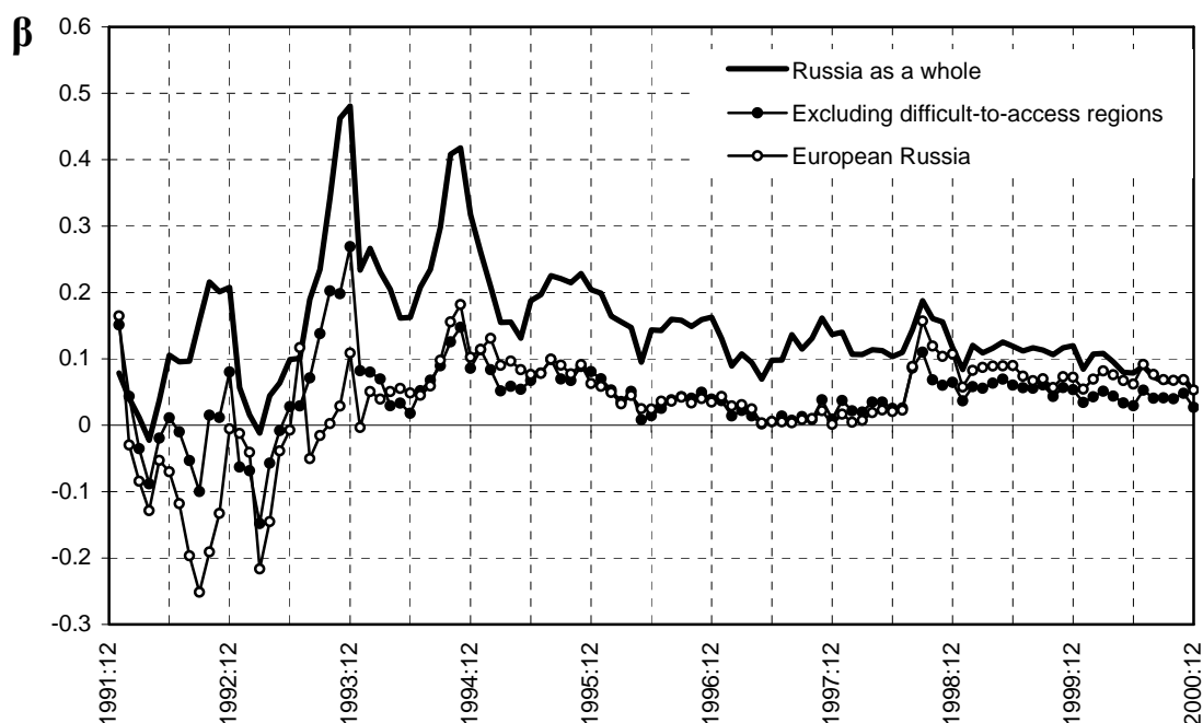
Figure 2. Evolving integration of market for beef

Figure 3 demonstrates the evolving pattern of integration in the market for sugar. It differs sufficiently from the patterns for the markets discussed above as well as for the aggregated market of 25 staples. First, there are no indications of substantial segmentation in the early years of transition that is peculiar to other markets. Second, beginning as early as the second half of 1993, the degree of integration of the sugar market remains more or less stable.