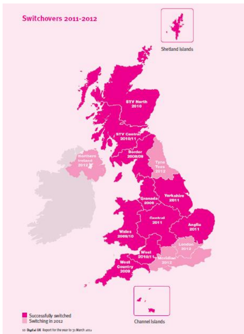
Figure 2: Switchover in UK (Resources: Digital UK, 2012)

The first area facing the switchover in UK is Border, followed by 14 areas (Figure 2). UK was committed to starting T2-based HD service by end 2009. When the UK government established the DVB-T2, they decided to make DVB-T and DVB-T2 totally different in the technologies characteristics. Therefore, they are incompatible so that it could avoid the problems DVB-T faced and improve its quality.