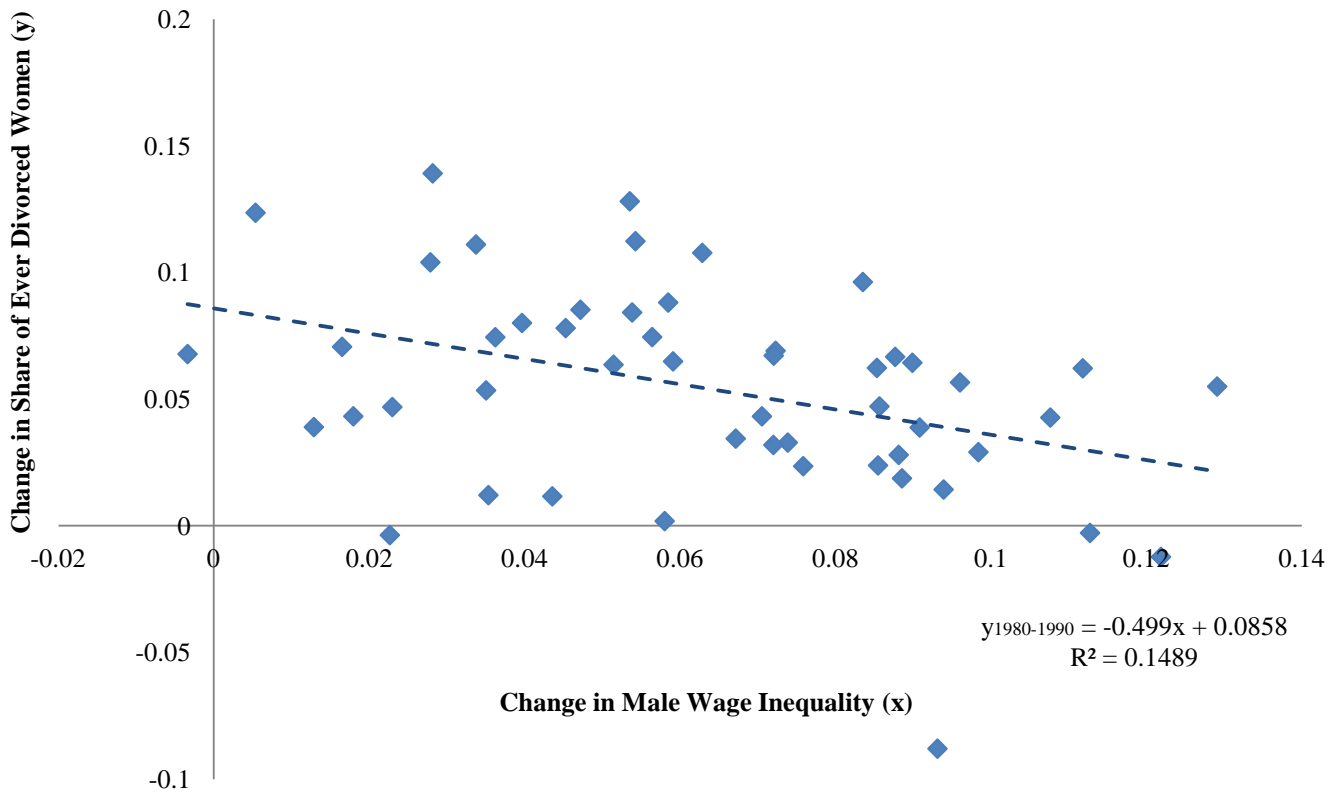
Figure 2: Change in Inequality & Divorce 1980-1990

Source: Author's calculations from the June and March Supplements of the CPS (1980, 1990). The stock of ever divorced women measures the fraction of ever-married white women 21 to 55 years old who were interviewed in 1980, 1990 and reported that they had separated at any point prior to or at the survey date.