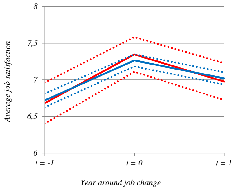
Figure 1: Contract Limitation and the Honeymoon-Hangover-Effect of a New Job