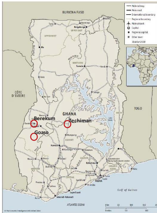
Figure 1: PSED intervention areas