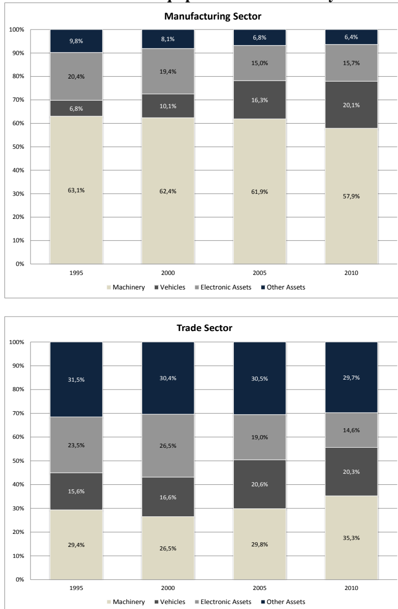
Figure 2: Nominal Shares of Equipment Investments by Sector and Asset