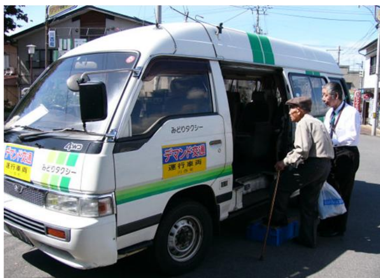
Figure 2. Community Bus in Japan

Community buses are used to extend networks beyond core bus routes. These provide critical services for elderly people in peripheral areas, providing access to hospitals, shopping areas and railway stations, the main destinations for users of these services. With the ageing of the population, widows are now the largest category of passengers on community buses and are typically either too old to drive or have never driven, having previously relied on a husband for mobility.