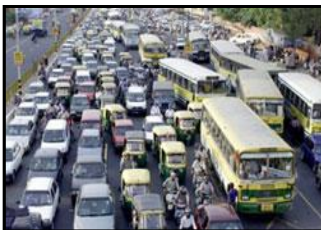
Figure 1. The Coordination Problem