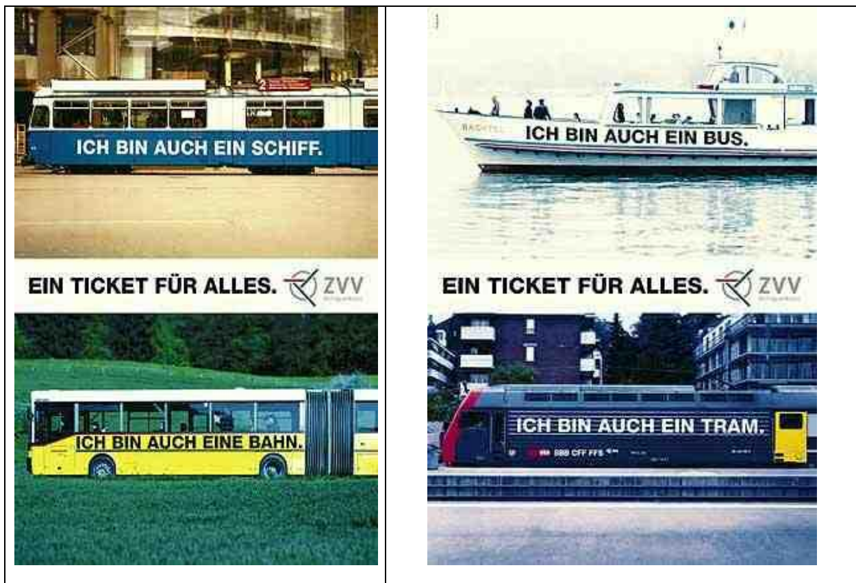
Figure 3. Integrated Services and Tariffs – A Swiss Example