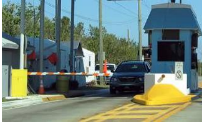
Compliance control by barrier

The aim of compliance activities is that on average a compliant user pays less than a non-compliant one. There are two extreme options to achieve this target. The first is to have many compliance checks and a low penalty. The second is to have only occasional compliance checks but high penalties. There is a limit to penalties that is given by political and legal acceptance. This limit defines the minimum density of compliance checking activities required in a system.