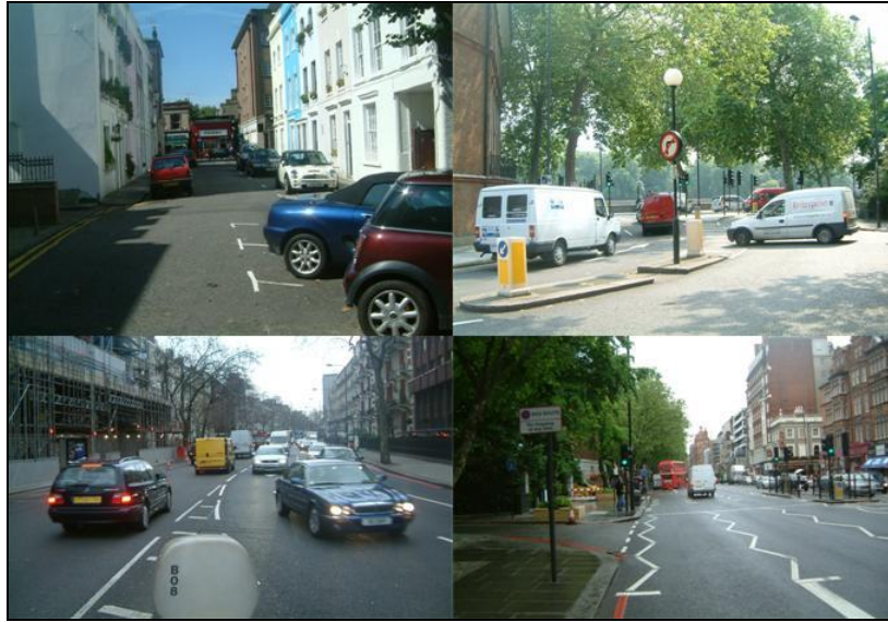
Examples of Variable Road Topologies