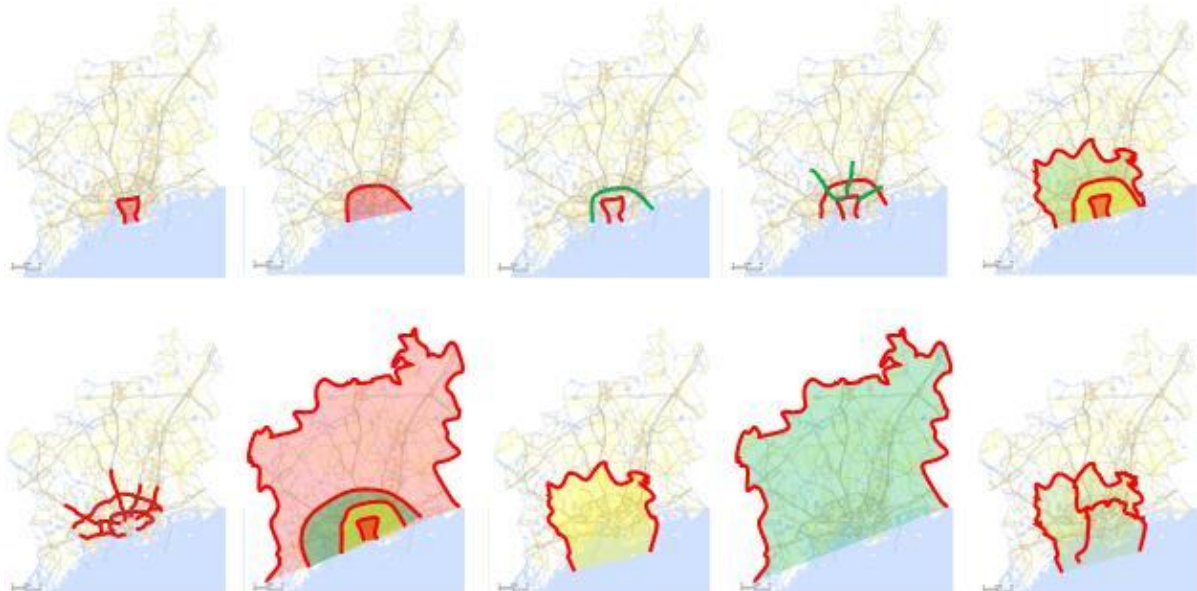
Ten options discussed for a congestion charging scheme for the city of Helsinki (Ref. 4)

Marginal social cost pricing is a theoretical concept. Practical implementations will try to consider these results but will in practice be limited by very mundane considerations.