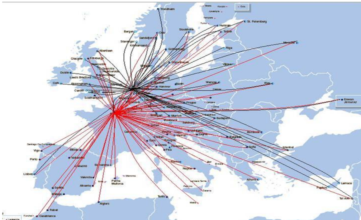
Figure 2. Air France and KLM Merged Network: Paris and Amsterdam

In summary, airport dominance allows a carrier to achieve hub premium and enjoy other related advantages. 16 An airline prefers to have its own exclusive hub rather than to share a same airport with other carrier's hub function. While a carrier may set up an optimal multiple hub network for continental coverage, it can not afford to have more than one hub within a region. All of these factors indicate the following: