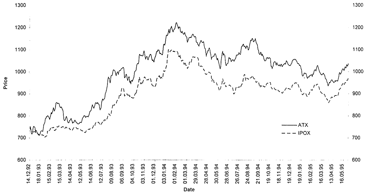
Table 2: Sample autocorrelation for observations 1 to 500