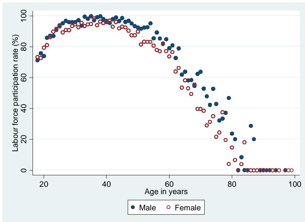
Appendix Figure 2 Labour force participation rate by gender and age