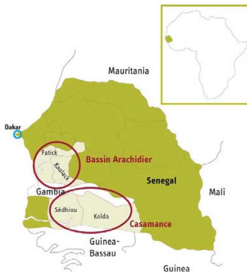
Figure 1: ERSN intervention areas

ERSN has two target regions: the Bassin Arachidier and the Casamance (see Figure 1). The analysis in this paper is restricted to SHS dissemination in the Casamance region. Concerning the geographical conditions, the Casamance is largely separated from the rest of the country by The Gambia and the homonymous Casamance River. This isolation led to both political and economic marginalization. In addition, the