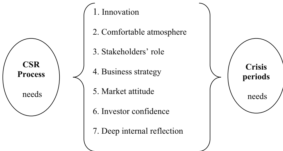
Figure 1. CSR implementation process and crisis periods: necessities.

Although these models are diverse, there are a set of common issues in nearly all of them which can be redirected to change the perspective of implementing CSR models from a threat to an opportunity in periods of crisis (Figure 1):