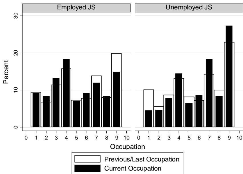
Graphs by whether was employed or unemployed job seeker

Legend: 1 managers and senior officials; 2 professional occupations; 3 associate professional and technical; 4 administrative and secretarial; 5 skilled trades occupations; 6 personal service occupations; 7 sales and customer service occupations; 8 process, plant and machine operatives; 9 elementary occupations