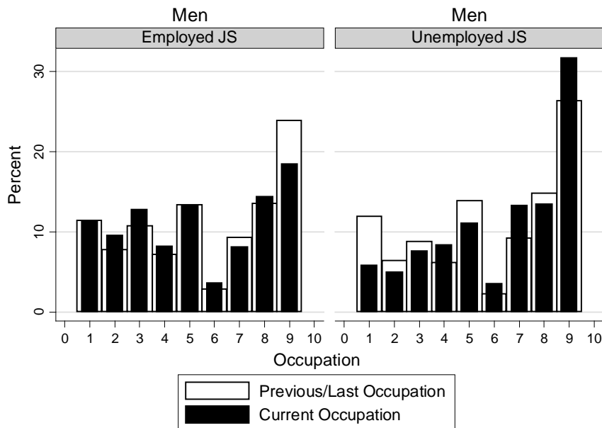
Graphs by whether was employed or unemployed job seeker