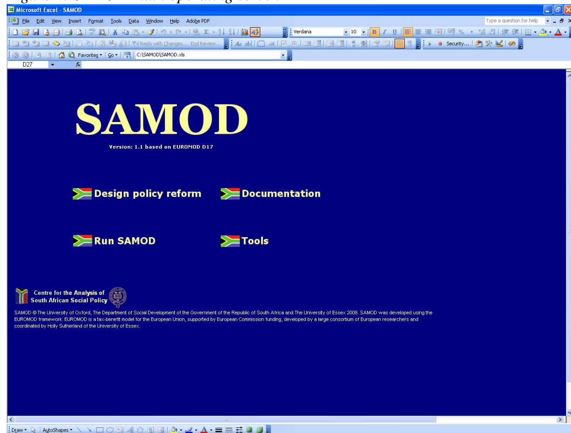
Figure 1: SAMOD main operating screen

Although the design of the model can be easily adapted to a single country there are some EUROMOD features which are unnecessary in the case of a single country but which cannot be removed, for example, parameters relating to exchange rates. In addition, it is not currently possible to remove all country-specific variables from EUROMOD which results in a number of ‘unnecessary variables’ remaining in the model.