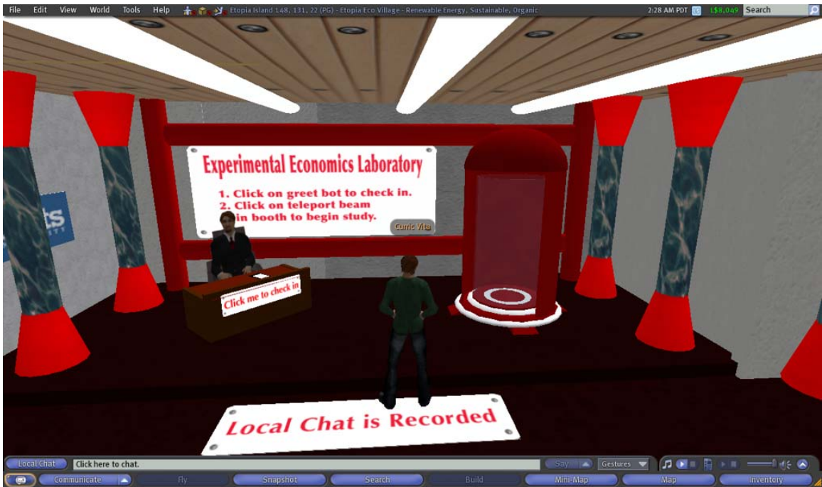
Figure 1. Picture of 'lobby' area of laboratory. Subjects first clicked on the automated greeter to be welcomed to the lab, then on the booth to the right to be transported to a private treatment room.