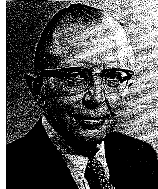
Paul W. McCracken