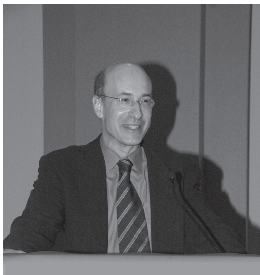
Kenneth S. Rogoff