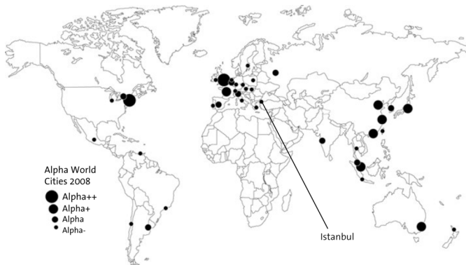
Figure 1: Map of Global Cities According to GaWC 2008