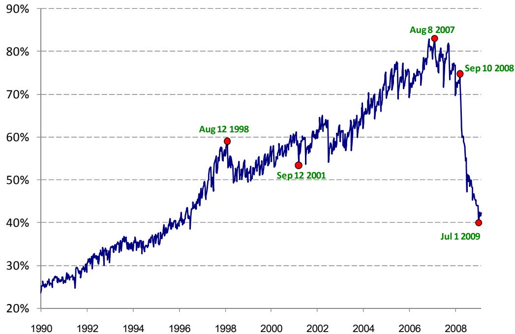
Figure 3: Repos and Financial CP as Fraction of M2 (weekly)