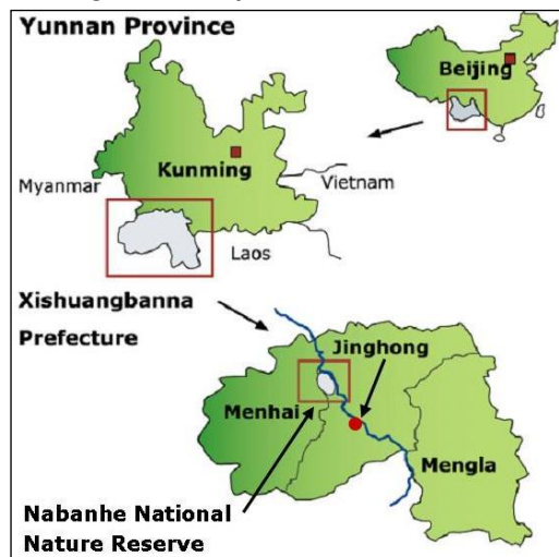
Figure 1: Map of Xishuangbanna Prefecture and its location in China (LILAC 2006)

New rubber plantations established in the last two decades were planted almost exclusively on former forest plots on sloping hillsides, since the valley bottoms are used for the cultivation of paddy rice and other crops. It is thus the tropical forest that has suffered most from the recent expansion of the rubber sector. Therefore, this region exemplifies the typical trade-off between economic development on the one hand and environmental conservation on the other.