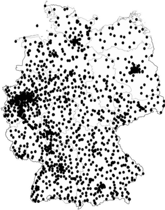
Figure 2: German hospital distribution