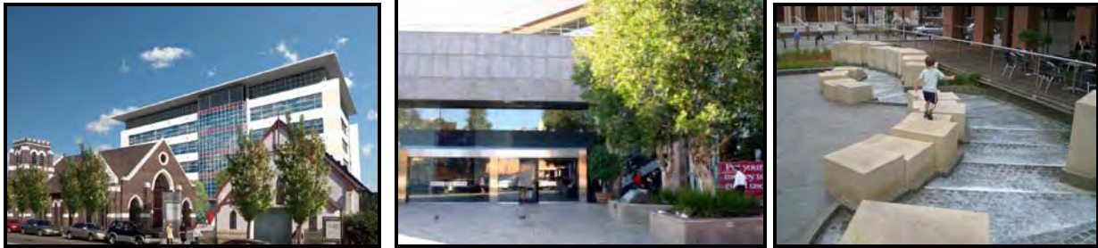
Figure 7. Kogarah Town Square: Sydney, Australia. Traditional architecture, central rail stations, and open civic squares add to the project’s kid-friendliness.

appeal to young professionals and empty-nesters, making for a culturally rich and demographically diverse community.