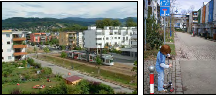
Figure 5. The Kid-Friendly Vauban District, Freiburg, Germany.