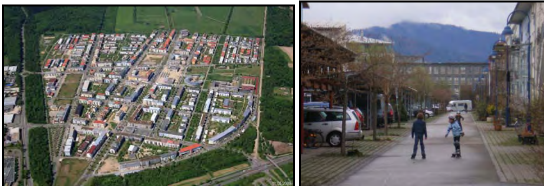
Figure 3. Rieselfeld District, Freiburg, Germany. Green spaces, kid zones, traffic calmed streets. Tram line runs through the tree-lined center of the village (left photo).

Rieselfeld can be described as "transit-led development" (TLD). The tramway opened in 1997, a year after the first families had moved in and when there were just 1,000 inhabitants. The presence of 3 tramway stations enabled urban growth to wrap itself around rail nodes. With 7-minute peak headways, residents can reach the city center in 10 minutes. Extensive bikeways and ped-ways -- along with carsharing, narrow shared "play" streets that slow traffic, a grid layout, and preferential treatments for trams, buses, pedestrians, and bicycles at intersections -- have further reduced the reliance Rieselfeld's residents on private cars (Figure 4). And parks, playground, green medians, and borders rimmed by nature reserves and hiking trails promote active living. Green mobility is reflected by modal split statistics: 16% of resident trips are by walking, 28% by bike, and 25% by public transit (Rieselfeld Projekt Group, 2007). Also, 90% of Rieselfeld residents buy monthly transit passes.