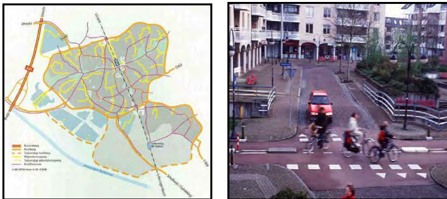
Figure 3. Houten, The Netherlands. Car-restricted interior invites cycling and walking.

direct walk- and bike-way connections to the railway station, extensive bike parking and lockers at the station itself, numerous soccer and basketball fields, green spaces, and water zones. As a result, 48% of trips are by bicycle and private-car travel is 25% below the national average for similar income communities (Beatley, 2000). A majority of access trips the rail station beyond a kilometer in distance are by bike-and-ride (Martens, 2007). With an annual traffic accident rate of 1.1 incidences per inhabitant (versus a national rate of 3.5), Houten is also one of the safest cities in the Netherlands (Beatley, 2000; Pucher and Buehler, 2008).