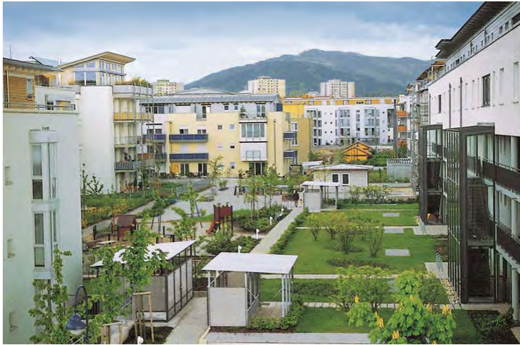
Figure 1. Kid-Friendly TOD in Rieselfeld, Germany: Gardens and play areas replace surface parking.

In the TODs reviewed in this paper, cars are de-prioritized and children are clearly prioritized. Families are attracted to the extensive shared green spaces, low- or no-traffic areas, and ample play space and cycling paths. Rather than catering to single households, the young, or old, these projects are specifically designed for and marketed to families. Experiences show that thoughtfully and inclusively designed TODs are kid-friendly in three core ways: (1) they emphasize pedestrian infrastructure, including sidewalks, internal pathways, and crosswalks (and at the same time often de-emphasize the car); (2) mixed land uses not only bring destinations closer together but also create active, vibrant street life and interior spaces, instilling safety and security through more “eyes on the street”; and (3) high-levels of transit service provide kids with (and make them less dependent on their parents for) access to the offerings of a city, be they museums, sports venues, or retail attractions. Researchers at the Center for Cities and Schools (CCS) at UC Berkeley note that TOD can have even broader appeal to kids and families: parents