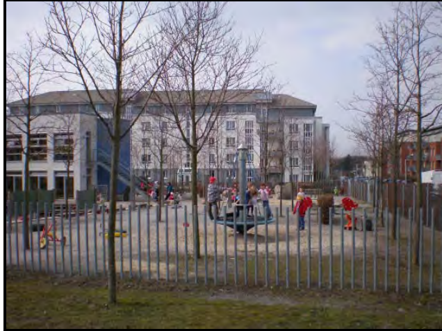
Figure 5. Kronsberg, Germany. Interior play areas dot this child-centric TOD