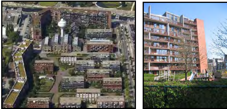
Figure 2. GWL-Terrein, Amsterdam, The Netherlands. Interior green spaces.

were happy to let their kids roam freely through the project, comforted by its insular, secure-feeling design, commons areas, and well-defined edges, including a canal to the south. Because of green spaces, the absence of cars, and well-lit, clearly defined pathways throughout the project, children can play safely and within eyeshot of a grownup. Local shops and a restaurant provide on-site destinations for kids to pick up a snack and a commons area for social activities. Most notably missing from the project is a neighborhood school or childcare center, though both can be found nearby.