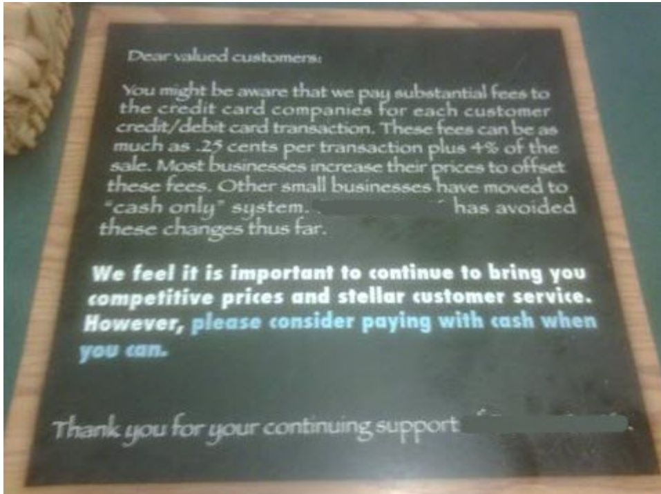
Figure 3: Merchant's appeal for cash