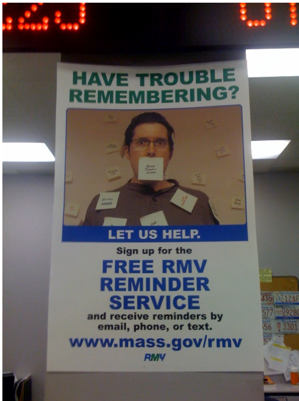
Appendix Figure 1: Free Reminder Service Offered at Boston DMV