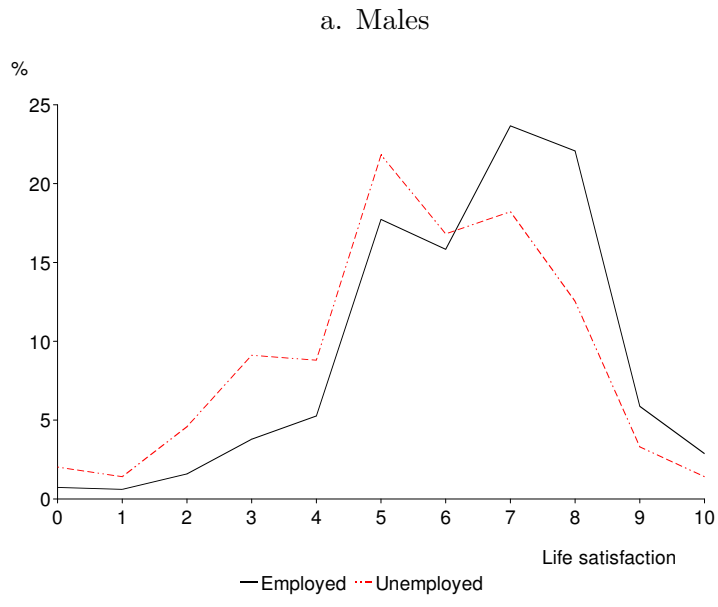
Figure 1: Distribution life satisfaction of unemployed workers; when employed and unemployed