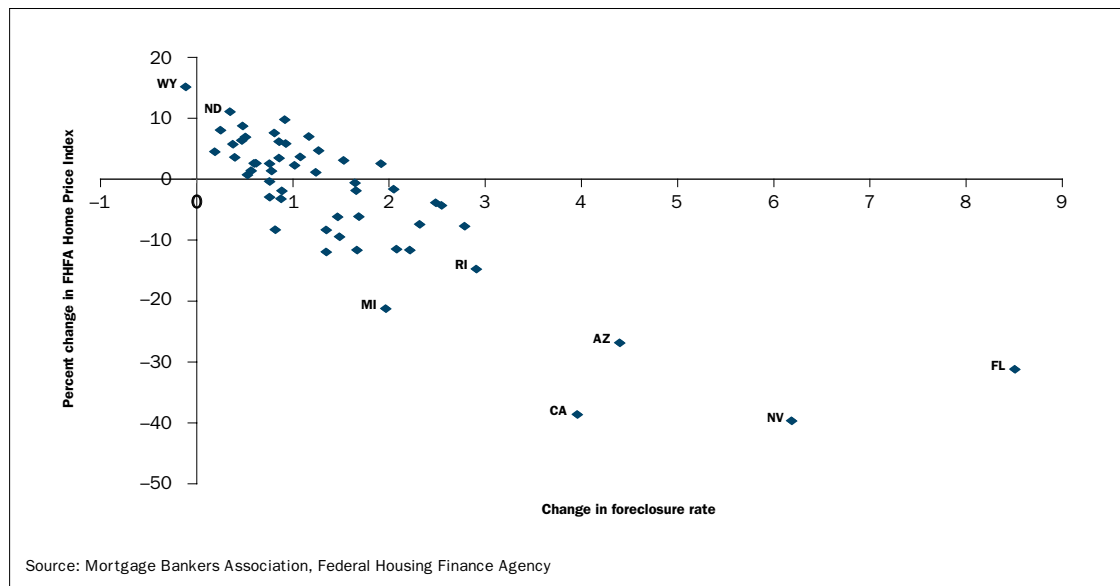
Figure 3 Change in foreclosure rate and FHFA House Price Index by state, 2006Q1–2008Q4

lot size, the square footage and age of the home, and the number of bedrooms and bathrooms) and neighborhood characteristics. Notably, studies vary significantly in their coverage of property and neighborhood features—with the latter often simply proxied for using location indicators like ZIP code. Nevertheless, if one thought these property and neighborhood characteristics were well controlled for, any statistically and economically significant foreclosure discount could then presumably be ascribed to differences in property quality or liquidity. Note that, to date, there has been only limited investigation seeking to identify these two effects separately.